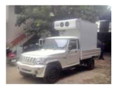
DT1 on Boloro Pickup