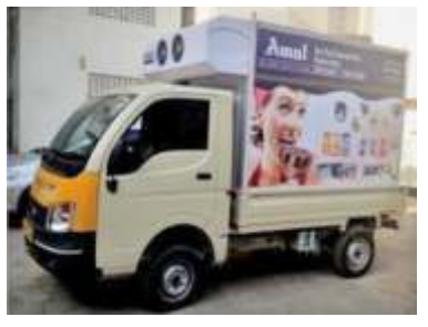
Dt1 on Tata Ace