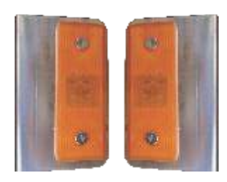
Side Marker Light : Functions of side marker lamp & side reflex reflector