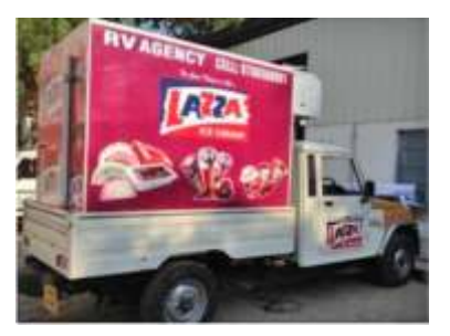
DT1 on Bolero Maxi Truck