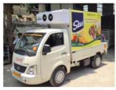
DT1 on Tata Super Ace