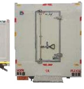
Single Loft Door